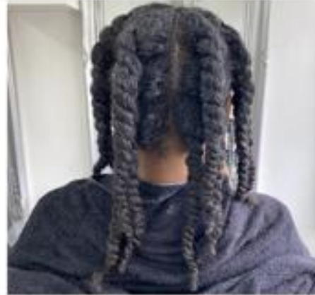
This is fully detangled Hair