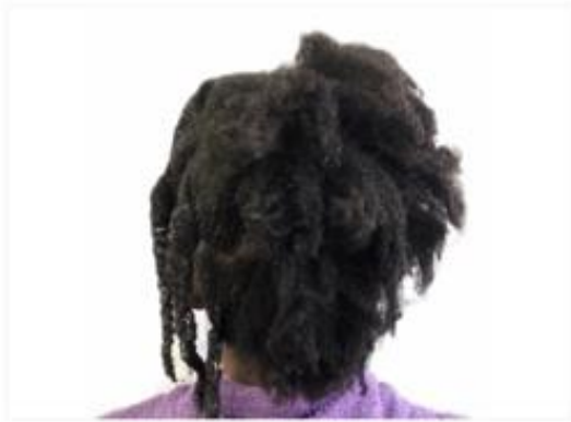
Hair in this condition on the right Needs a Extreme Detangle booked onto your appointment